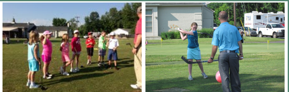
Junior Golf has begun with three different age groups and times. Please check out www.twinlakesgolfclub.com for schedules and lessons. Not only do the kids learn golf skills, they also are taught golf etiquette. This is evidenced by the many Juniors who come in the clubhouse after their lessons. We have some very nice Juniors!